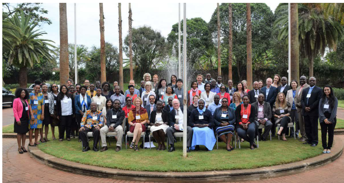
Participants at the 2018 Hilton Foundation Convening of partners funded under the Children Affected by HIV Strategic Initiative, held 12-14 March, at the Windsor, in Nairobi, Kenya